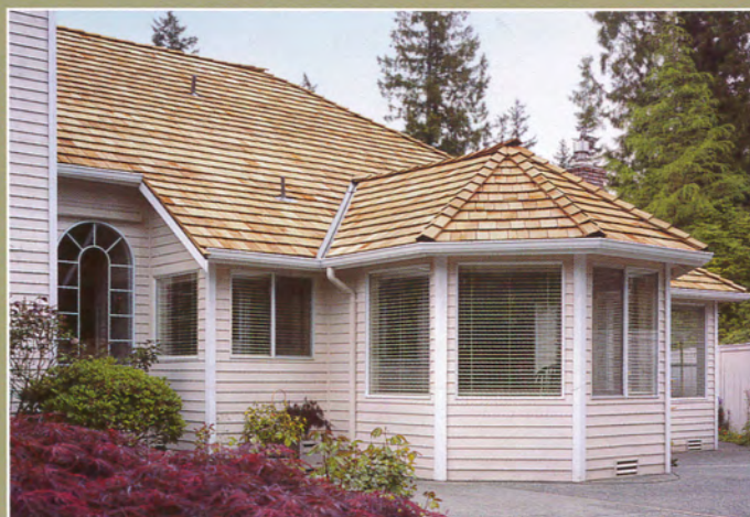
3/4" Premium Reserve™ Tapersawn Shake