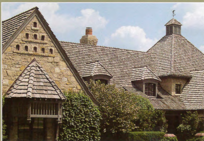
1" Jumbo Reserve™