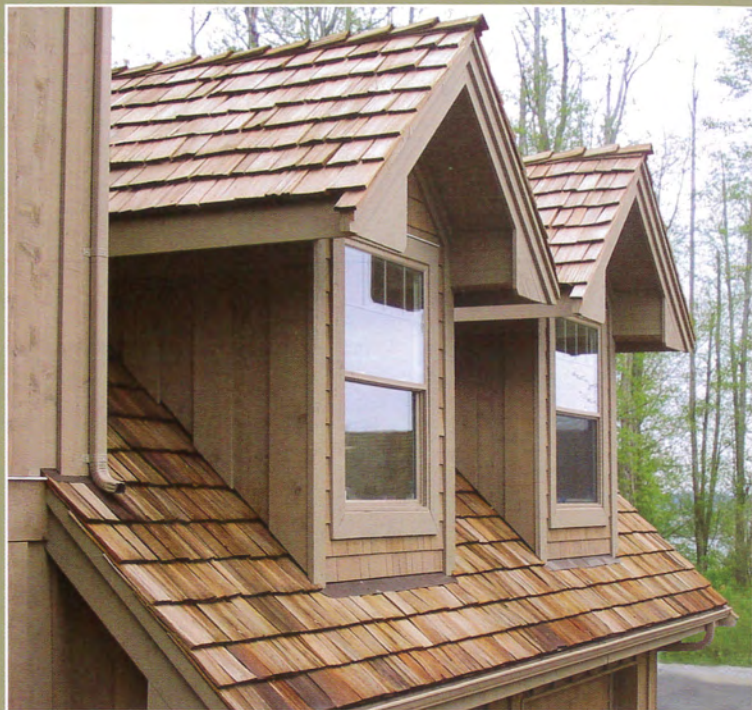
3/4" Reserve Cut™